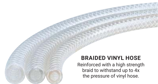
BRAIDED VINYL HOSE Reinforced with a high strength braid to withstand up to 4x the pressure of vinyl hose.